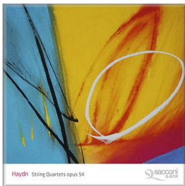
Haydn String Quartets opus 54