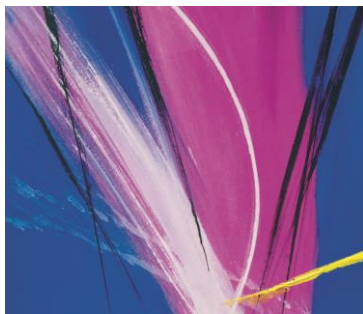
Beethoven String Quartets opus 18 Volume 1