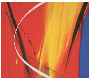
Dvořák, Smetana and Suk String Quartets